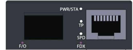
Figure 2. MCT-3002 WDM & SFP Front Panel