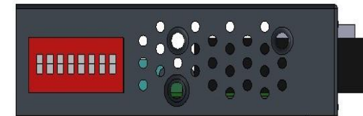
Figure 4. MCT-3002 Converter Side Panel